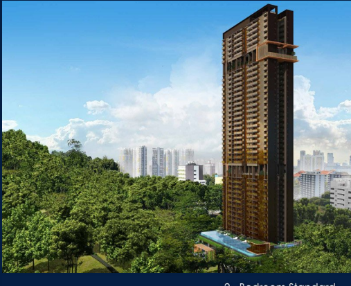
2 - Bedroom Standard