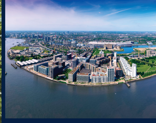
John Cabot House: 2 - Bedroom