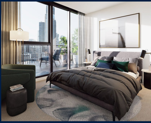
Roden: 3 - Bedroom