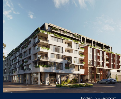
Roden: 2 - Bedroom