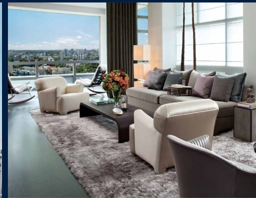
4 - Bedroom + Study