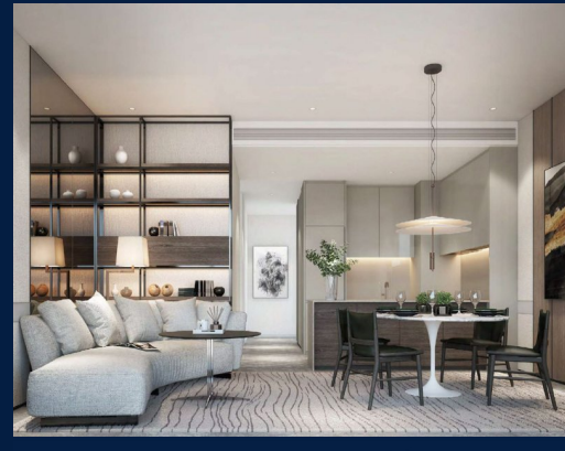
2 - Bedroom + Study