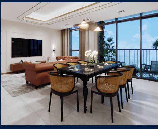
4 - Bedroom